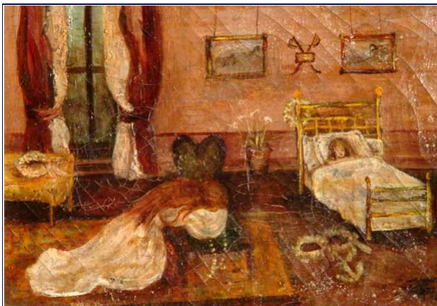
A Mother's Rosary by M Vasey

The Spelthorne Museum Collection paintings are shown below in a small size with a link to the BBC website for each painting. On that page you can click on the painting and it will be shown to you in a much larger size.