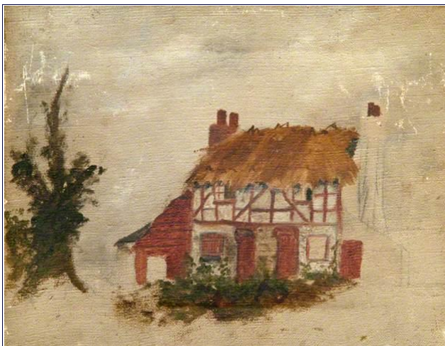
Cottages in Thames Street Unknown Artist